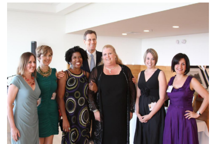
Home Trust Staff at the 2011 Opening Doors Fundraiser.