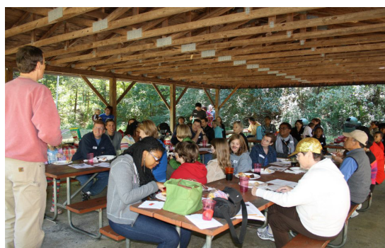
2012 Annual Picnic Meeting