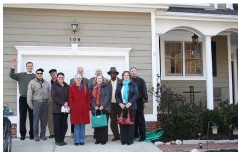
Spring Bus Tour