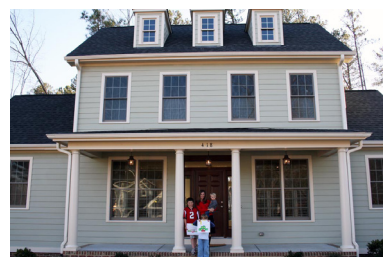
200th Home Sold in Montclair.