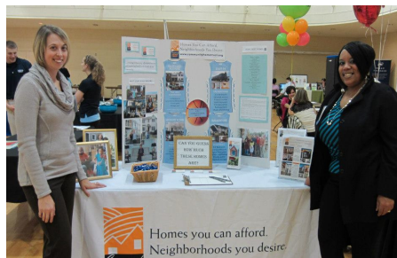
UNC Community Outreach Event